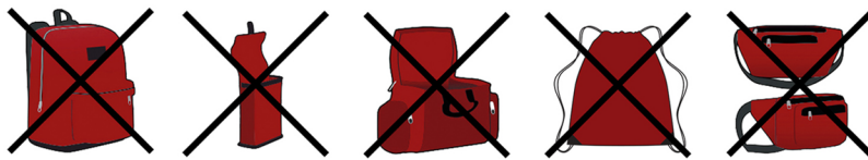
BACKPACK BINOCULARS CASE CAMERA CASE DRAWSTRING BAG FANNY PACK