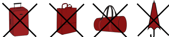
LUGGAGE REUSABLE GROCERY BAG DUFFLE BAG UMBRELLAS