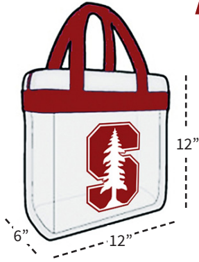
ONE CLEAR TOTE BAG Plastic, vinyl or PVC No larger than 12" w x 6" d x 12" h