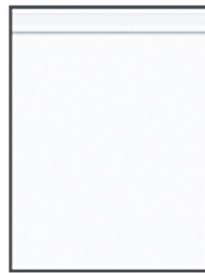
ONE PLASTIC STORAGE BAG One-gallon, clear