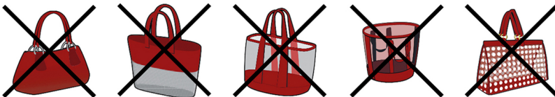
PURSE MESH OR STRAW BAG OVERSIZED TOTE BAG TINTED PLASTIC BAG COLORED OR PATTERNED PLASTIC BAG