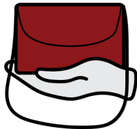
ONE SMALL CLUTCH BAG No larger than 4.5" x 6.5" Does not have to be clear