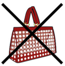
COLORLED OR PATTERNED PLASTIC BAG