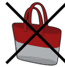
OVERSIZED TOTE BAG