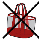
MESH OR STRAW BAG