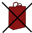
REUSABLE GROCERY BAG